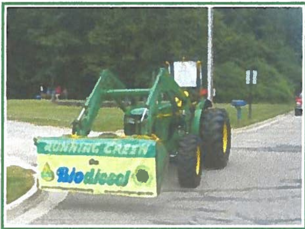
Most Major Manufacturers Using Hemp

The Michigan Department of Natural Resources, Parks and Recreation, began using biodiesel blends in 2005. Their press release on the Michigan.gov Website, "Biodiesel Fuel Used in Parks and Recreation Equipment," mentions "More than 25 facilities are using biodiesel blends to fuel their diesel mowers, tractors, bulldozers, backhoes and other diesel-powered heavy equipment."